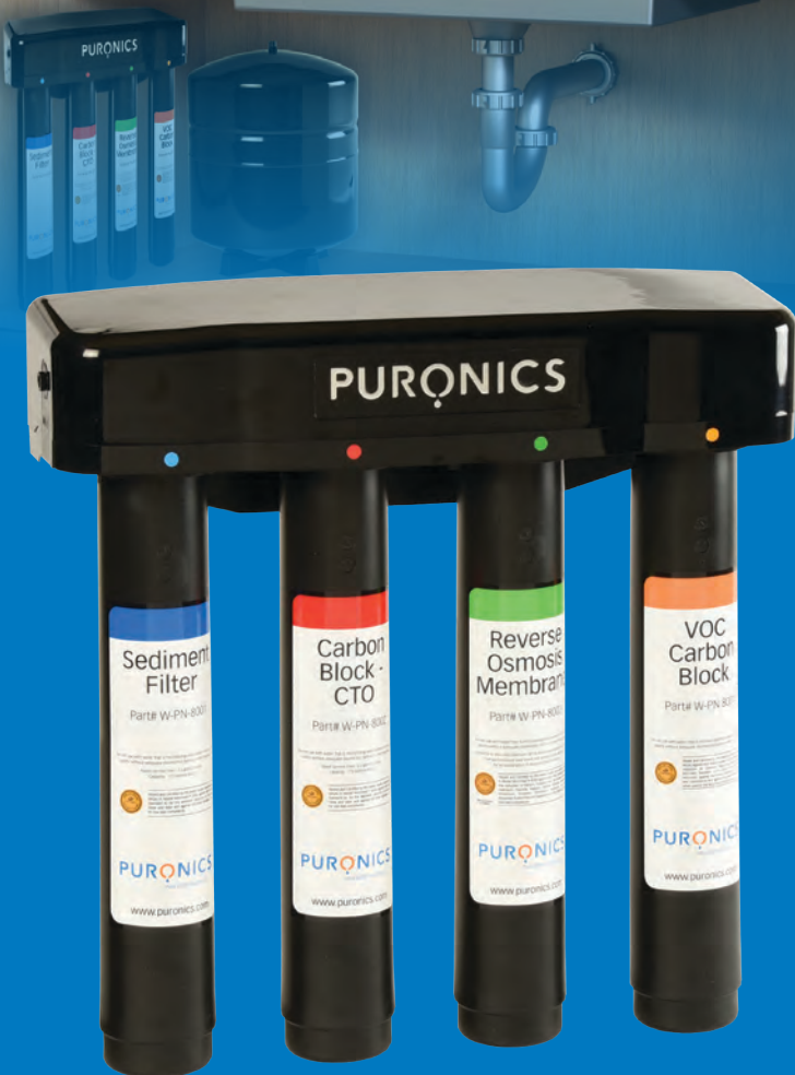
Food and beverages taste better

The Puronics® Micromax™ 8500 drinking water system is designed with advanced filtration technology for the ultimate protection and great tasting crystal clear water. This 5-stage system effectively reduces the majority of contaminants such as pharmaceuticals, PFAS (potentially toxic chemicals), chlorine, dissolved metals, lead, waterborne cysts, and others that may be present in your water supply. The simple design fits easily under any kitchen sink. The Micromax™ 8500 will assure your family will benefit from the reduced risks associated with emerging manmade and other contaminants that may be in water supplies.