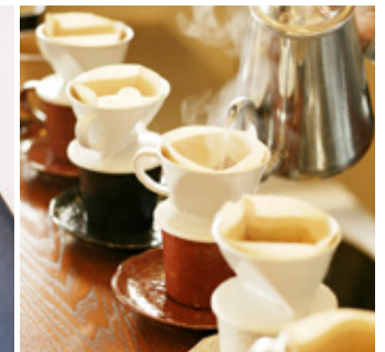
Better tasting beverages