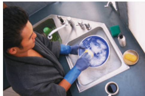
Dishes are cleaner