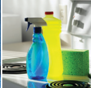
Reduced Scale saves maintenance and water heating costs