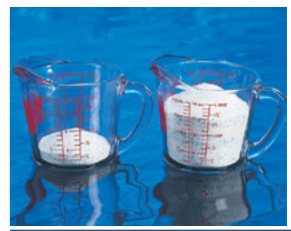
Dishes are Cleaner