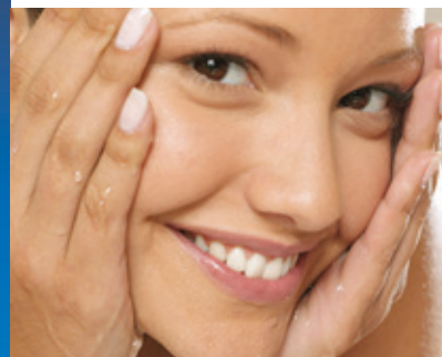
Food tastes better