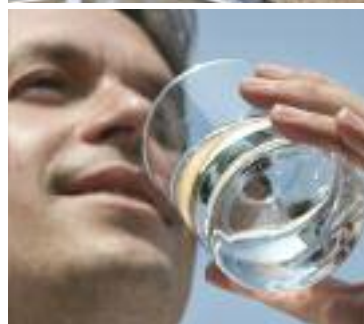
Better Tasting Water